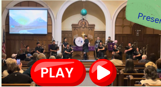
Kutztown Folk Music Society Preserving the Tradition